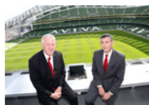
Lansdowne Road Stadium Development Company's Stadium Director,

Newly opened Park Regis Singapore, a property of Australia's StayWell Hospitality Group, has chosen StarHub to provide full deployment and management of all their IT and info-communications infrastructure so that hotel guests can experience next-generation information, communications and entertainment services throughout its premises. >