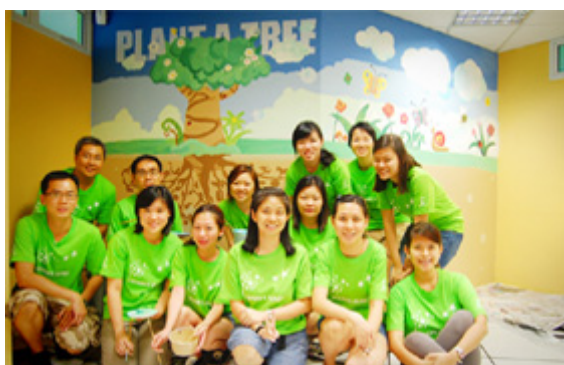
StarHub employees walking the talk with their environmental-friendly actions.